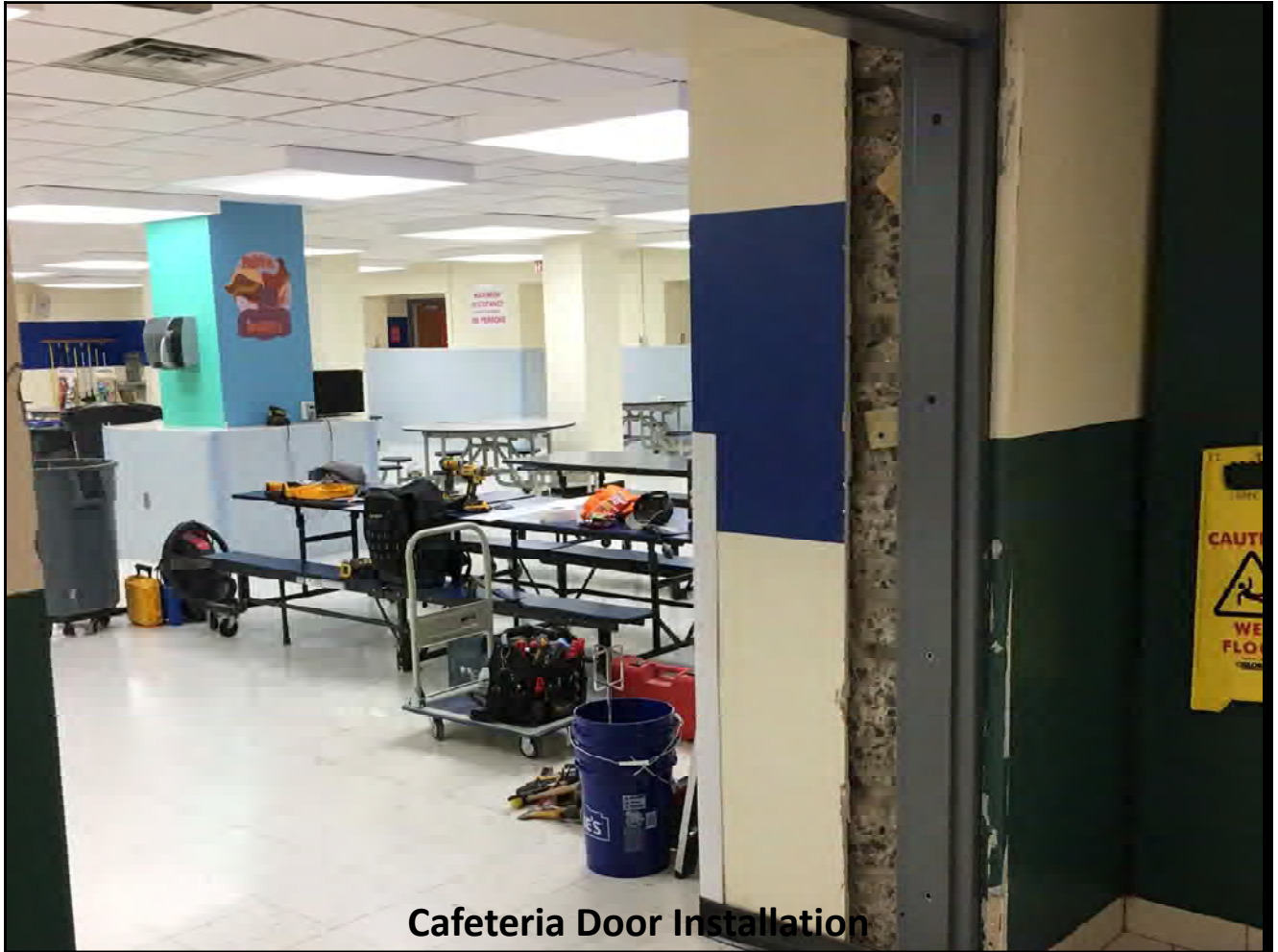
Cafeteria Door Installation